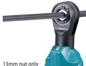
13mm nut only