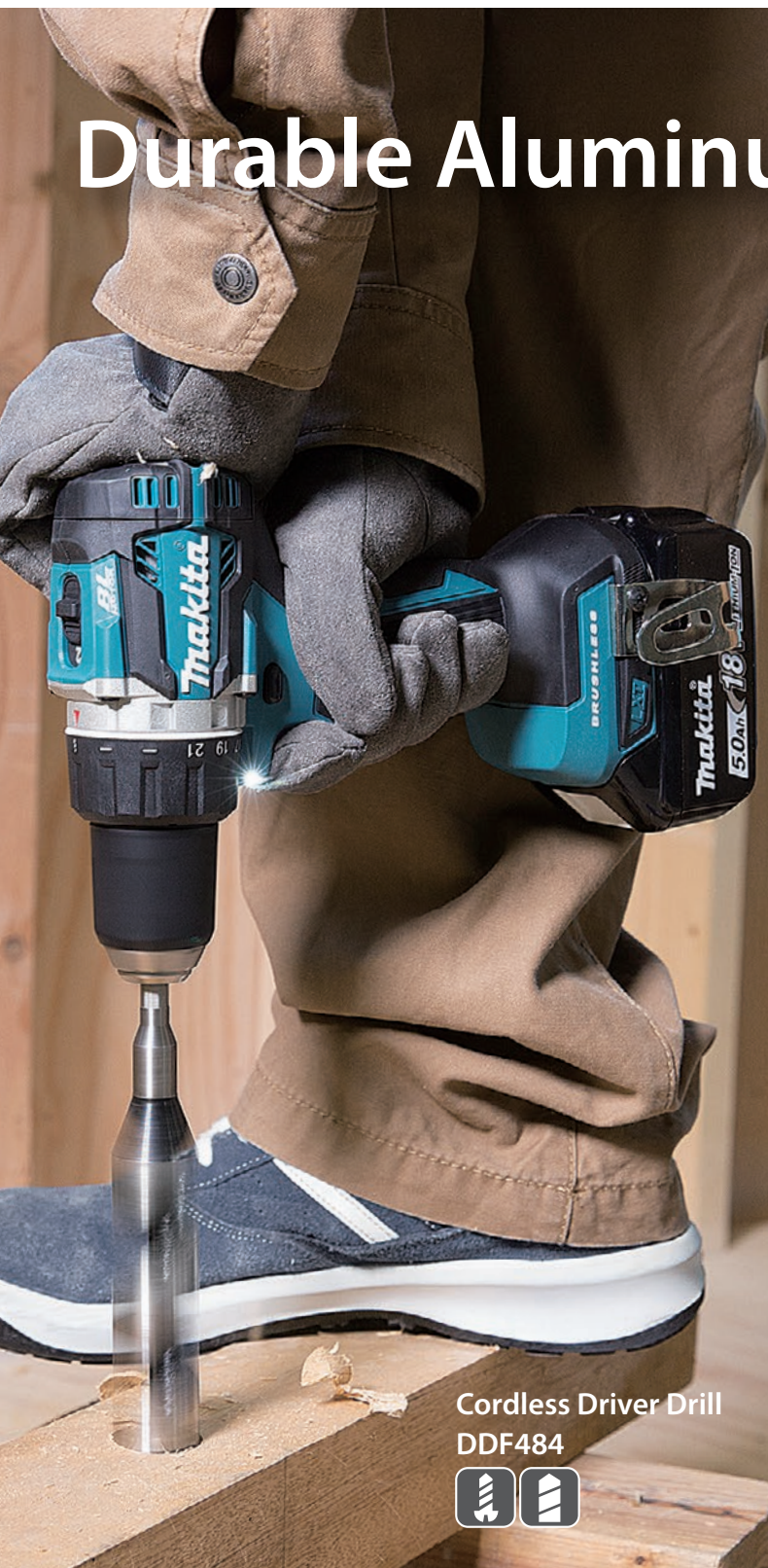
Cordless Driver Drill DDF484