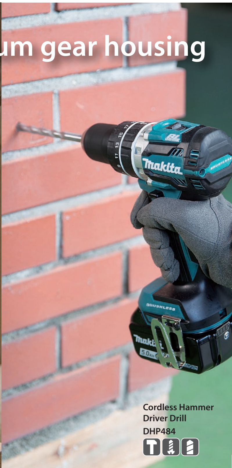
Cordless Hammer Driver Drill DHP484