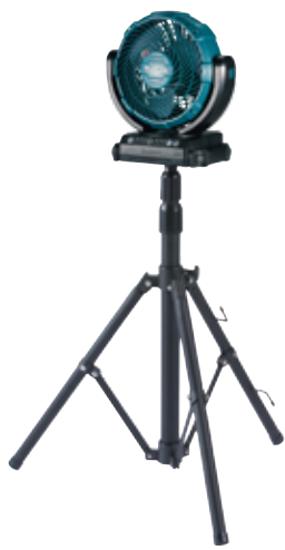
Can be mounted on some tripods