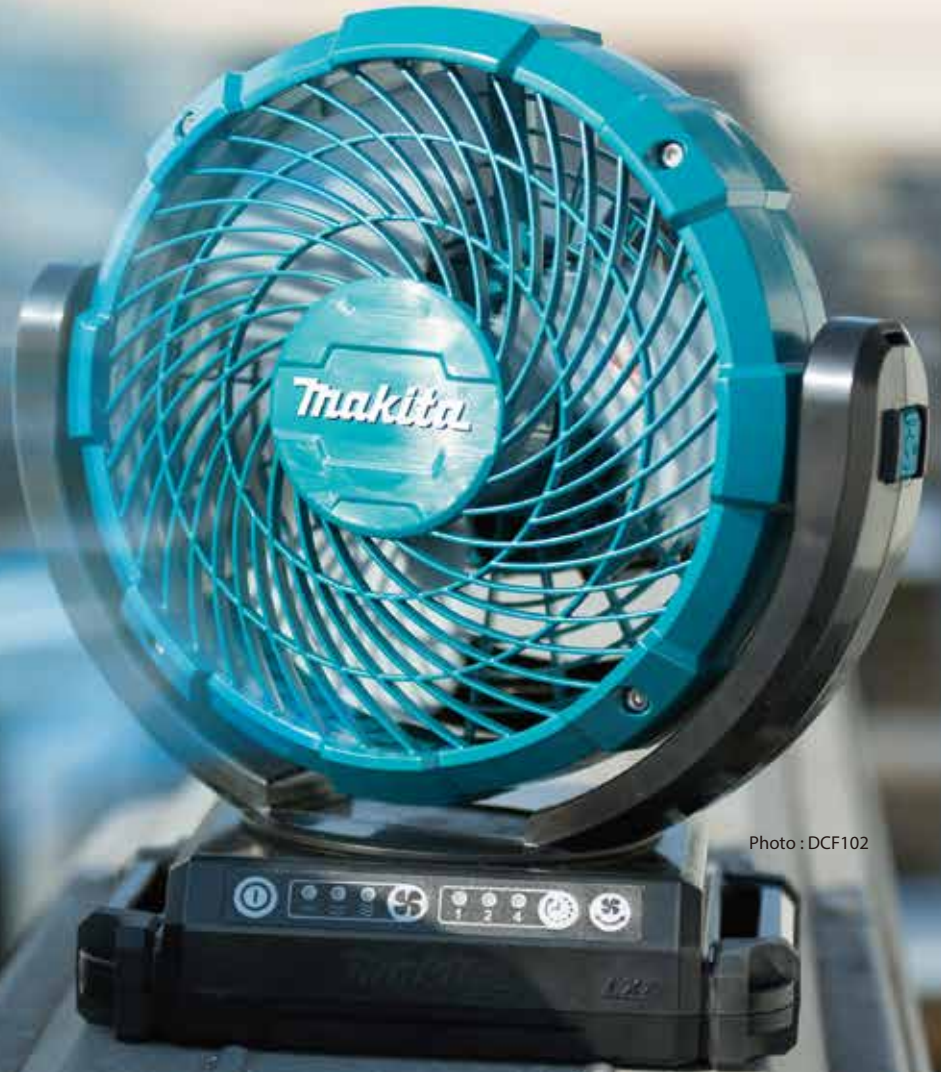
Photo : DCF102