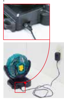
AC Adapter jack (option)