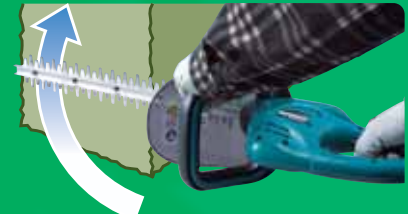
Gripping Front and Under grips for efficient hedge side trimming