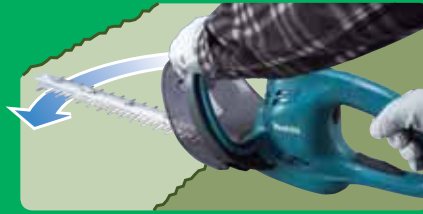
Gripping Front and Main grips for easy hedge top trimming